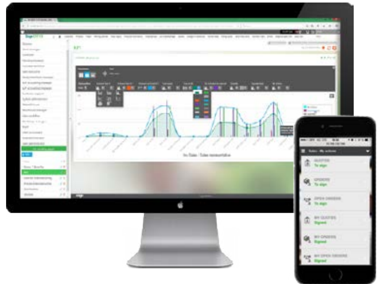
Accelerate business processes management with robust analytics and web apps.