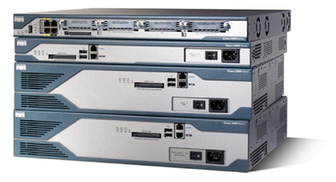
Figure 1. Cisco 2800 Series

Cisco Systems<sup>®</sup>, Inc. redefined best-in-class enterprise and small- to- midsize business routing with a new line of integrated services routers that are optimized for the secure, wire-speed delivery of concurrent data, voice, video, and wireless services. Founded on 20 years of leadership and innovation, the Cisco<sup>®</sup> 2800 Series of integrated services routers (refer to Figure 1) intelligently embed data, security, voice, and wireless services into a single, resilient system for fast, scalable delivery of mission-critical business applications. The unique integrated systems architecture of the Cisco 2800 Series delivers maximum business agility and investment protection.