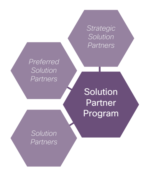
Figure 1. Solution Partner Program

The Cisco® Solution Partner Program will help you integrate your solutions with Cisco's world class architectures and technologies and navigate the increasingly complex world of selling and delivering integrated solutions to customers.