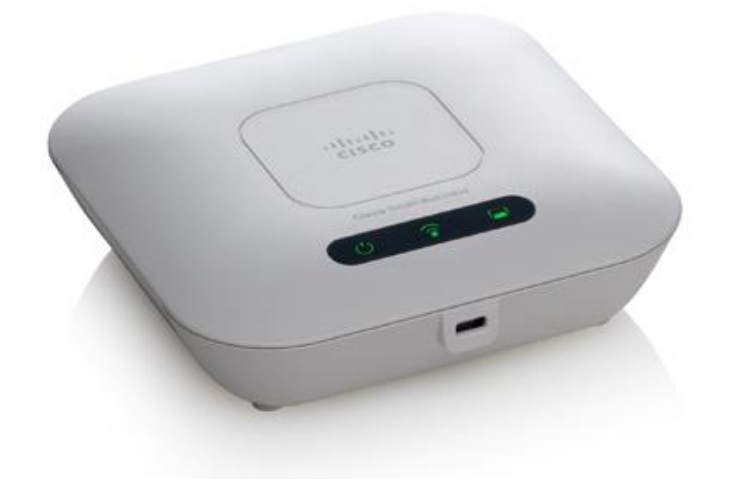
Figure 2. Front Panel of the Cisco WAP121 Wireless-N Access Point with Single Point Setup