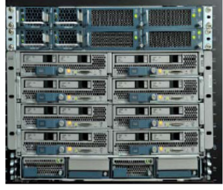
Cisco UCS in use