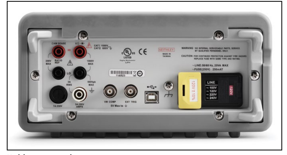
Model 2100 rear panel