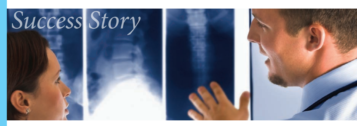
OfficeServ<sup>™</sup> Solution Helps Radiology Practice Communicate the Right Image