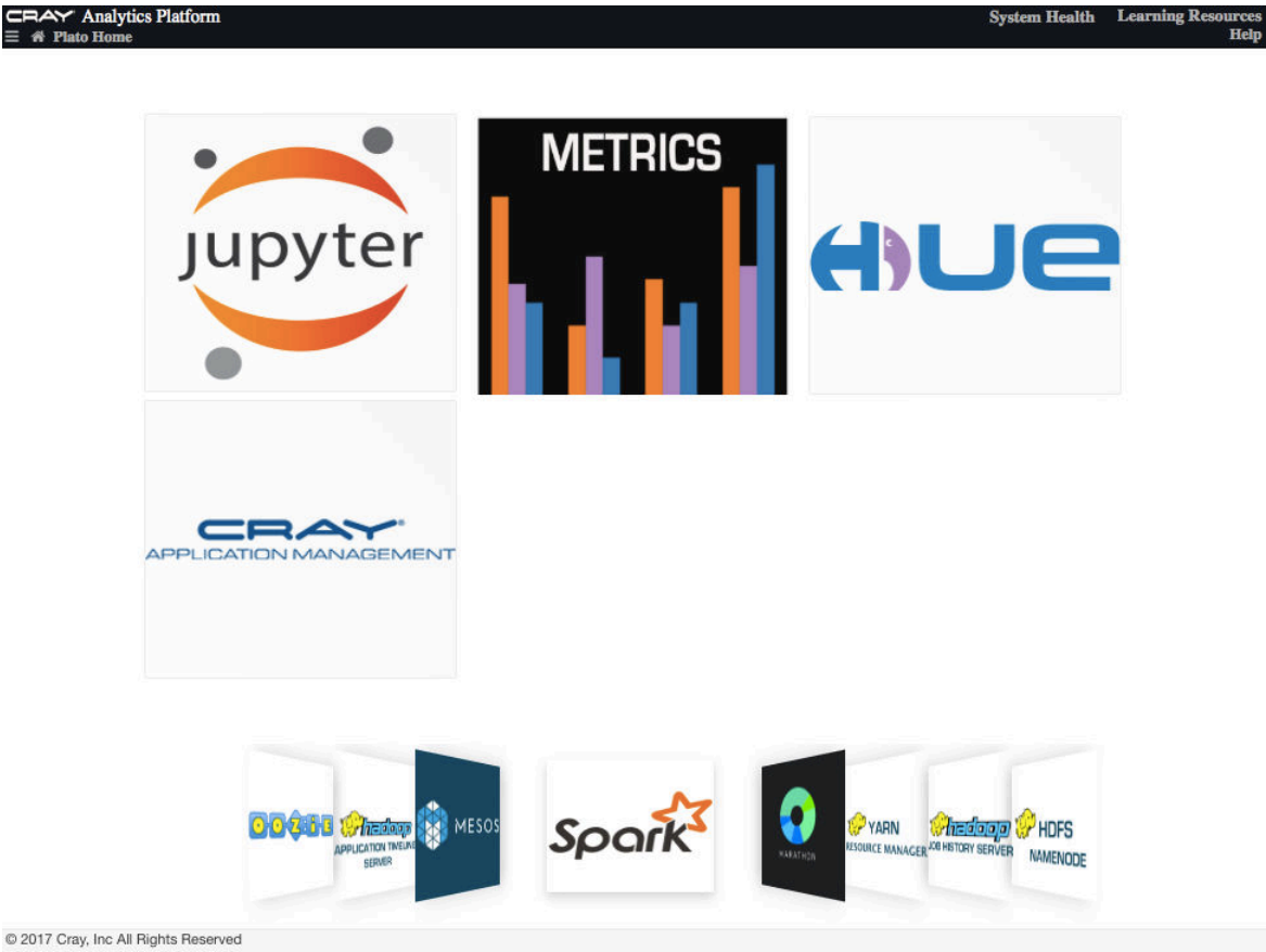
Figure 3. Urika®-GX Applications Interface UI