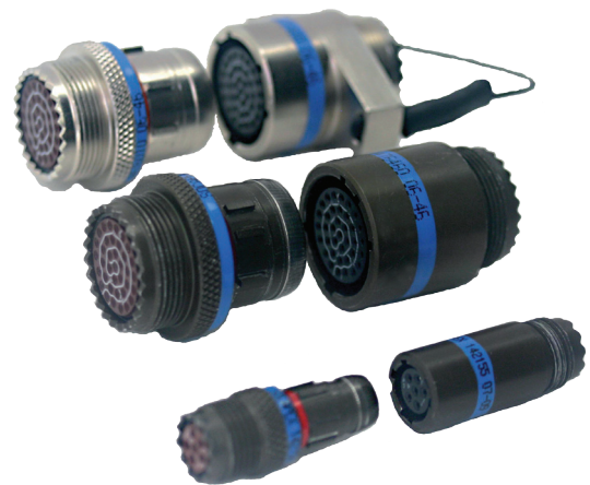
SC39 with HD38999 insert